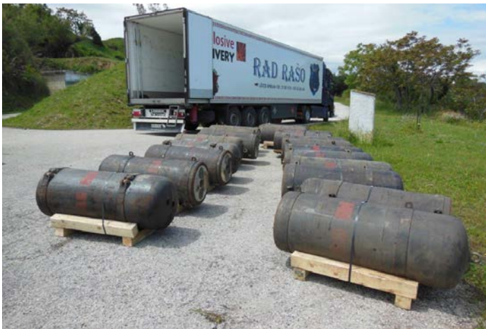
Surplus munitions requiring specialist demilitarisation (Esplosivi Sabino, Italy)