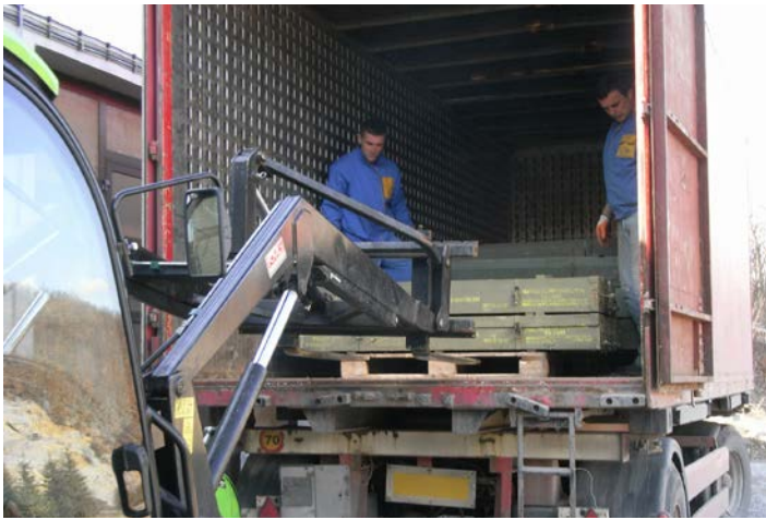
Demilitarisation (partial) of Maverick missiles (Poliex, Montenegro)